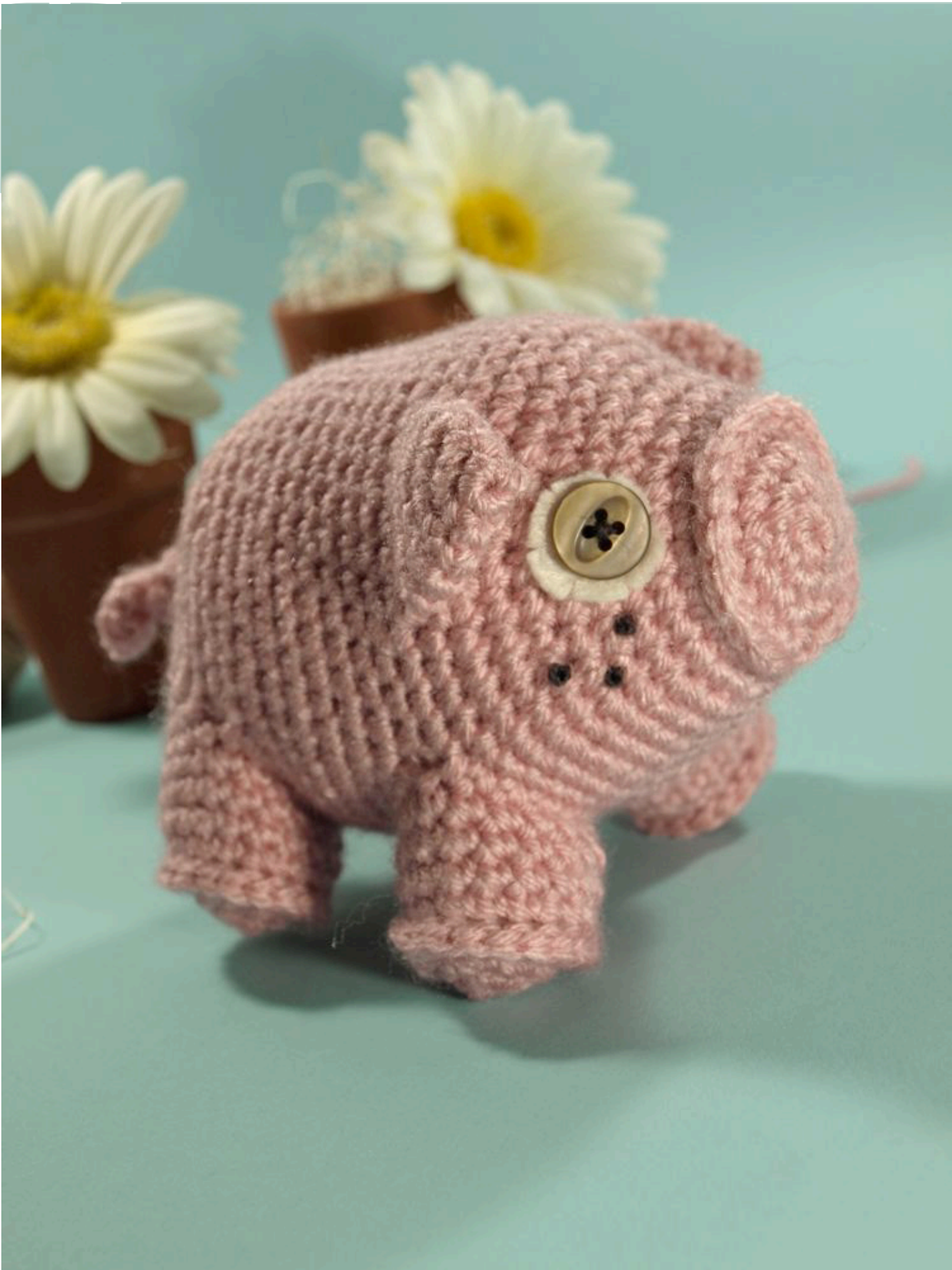
Copyright © 2012 Dawn Toussaint. All rights reserved. For personal use only.